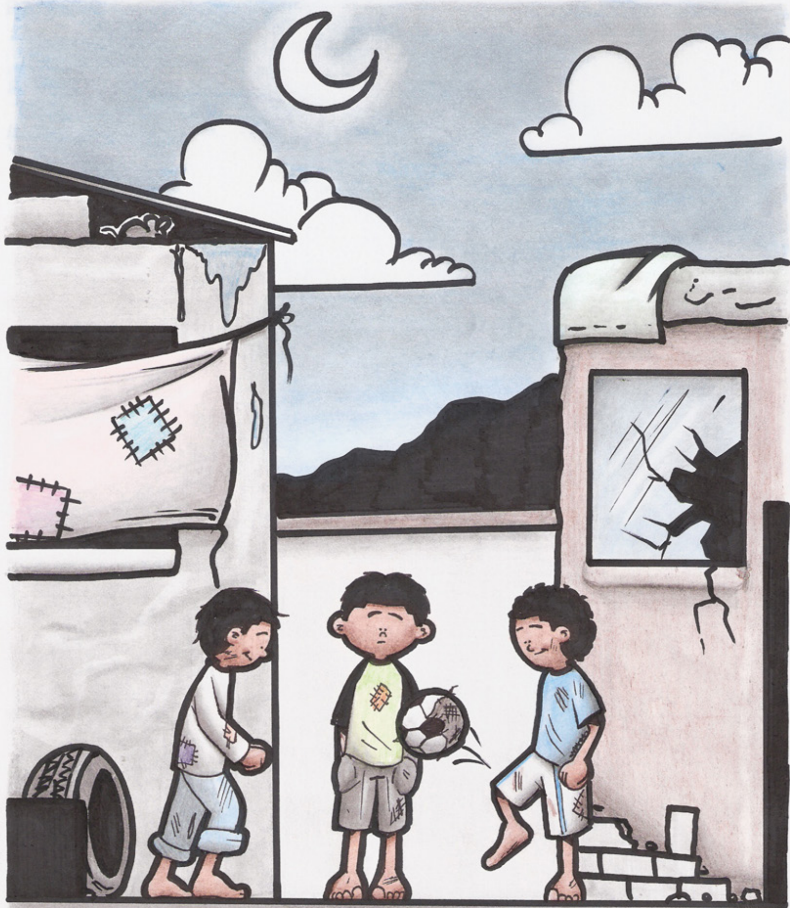
كنت طفل شارع