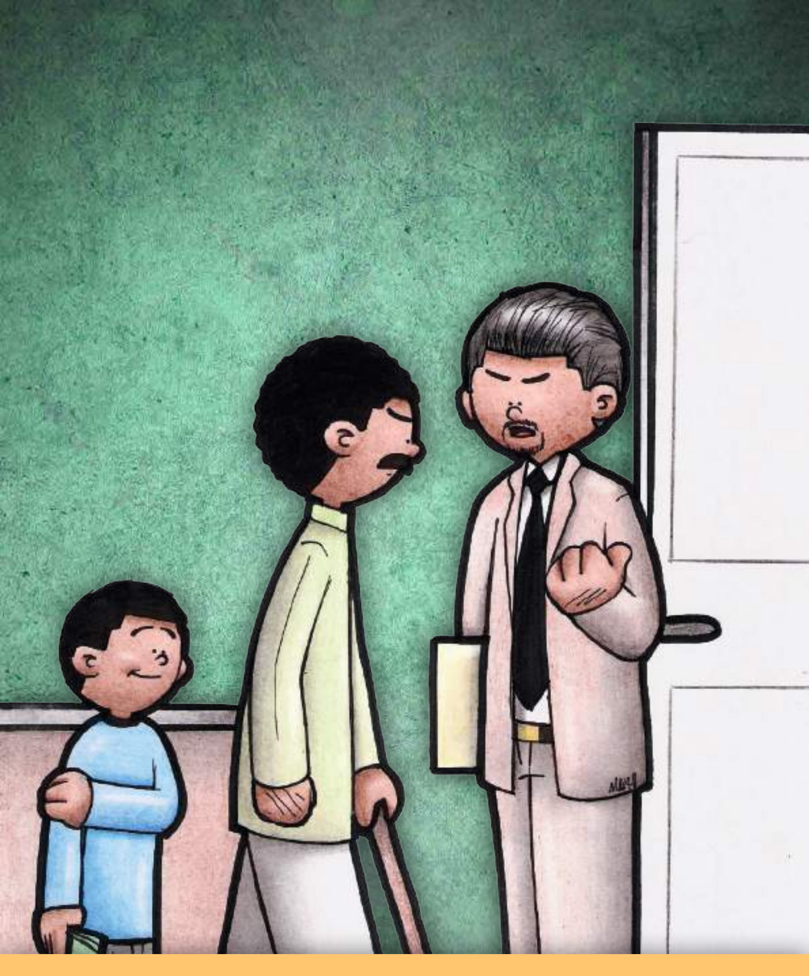
Give me fairness;