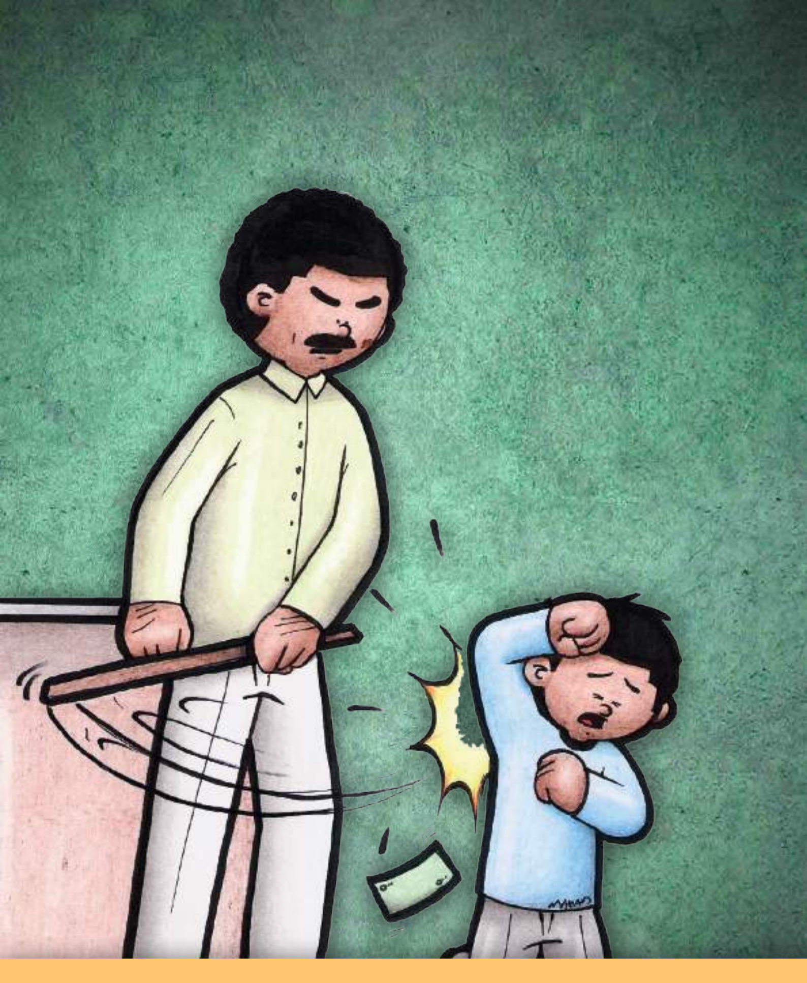
But there is no justification for degrading treatment;