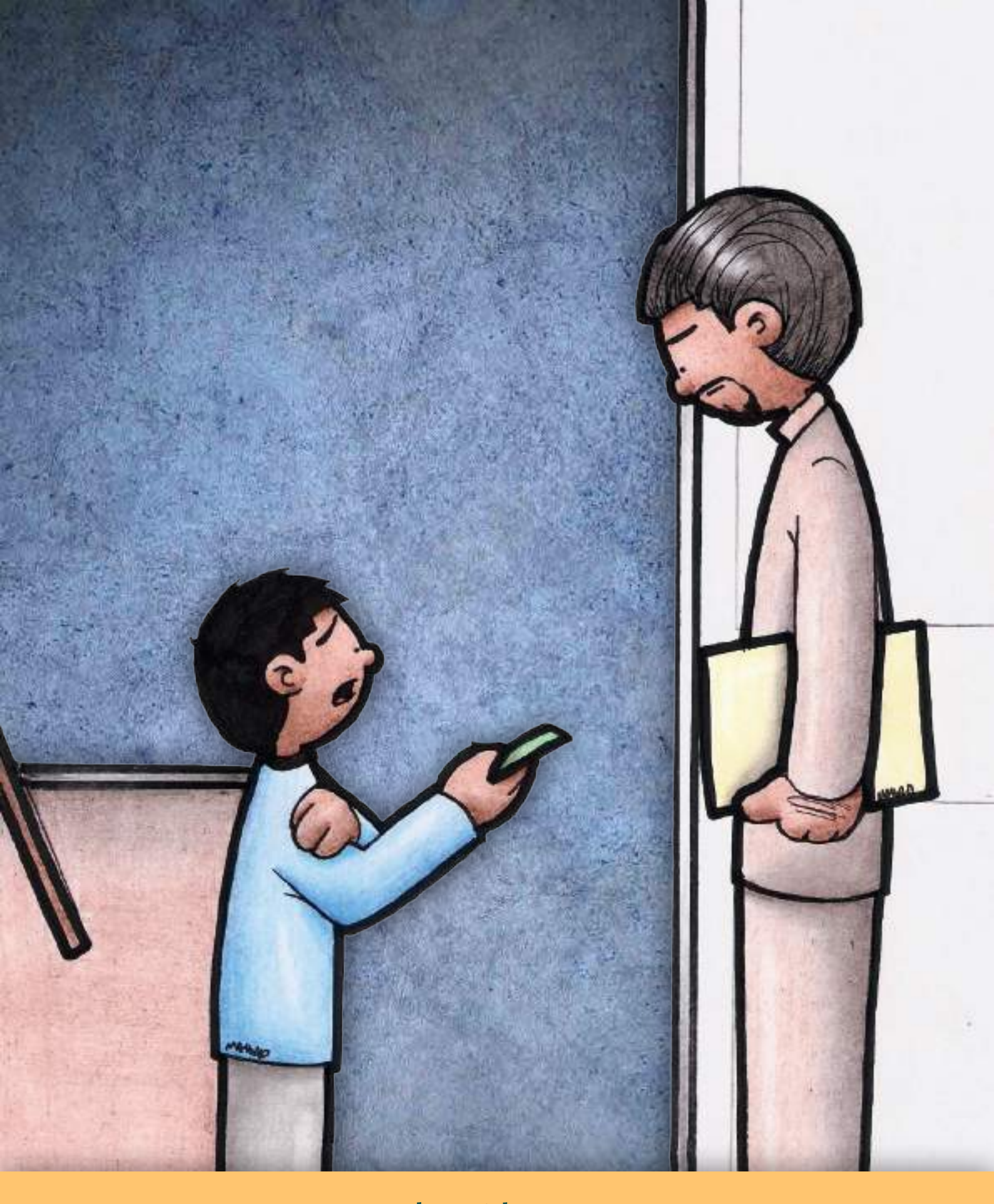
be with me;