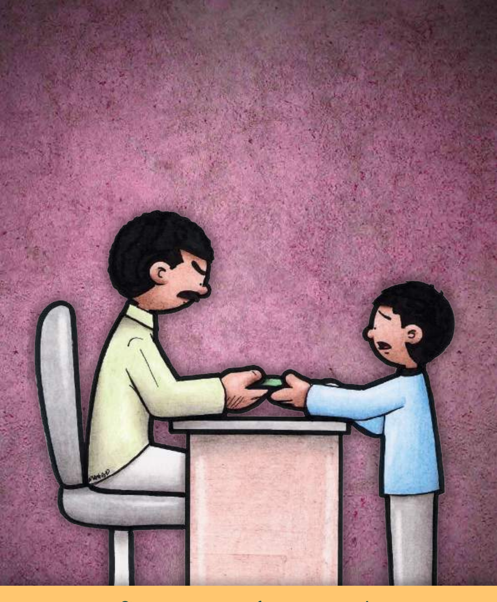
Circumstances may force me to work;