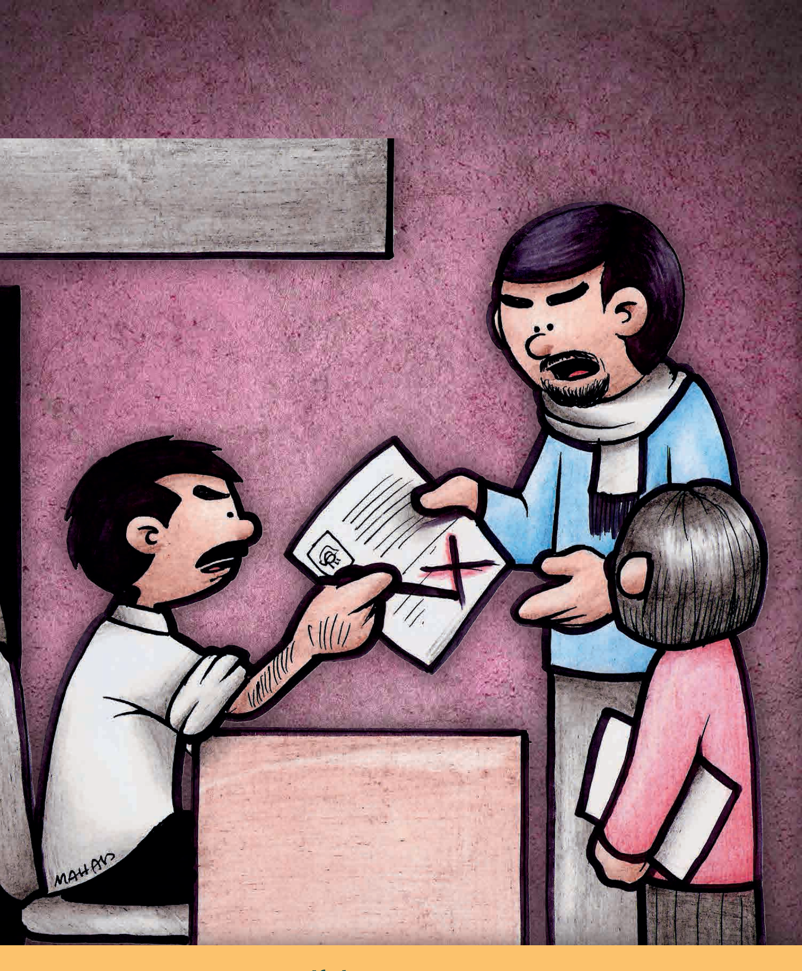
If they reject us.