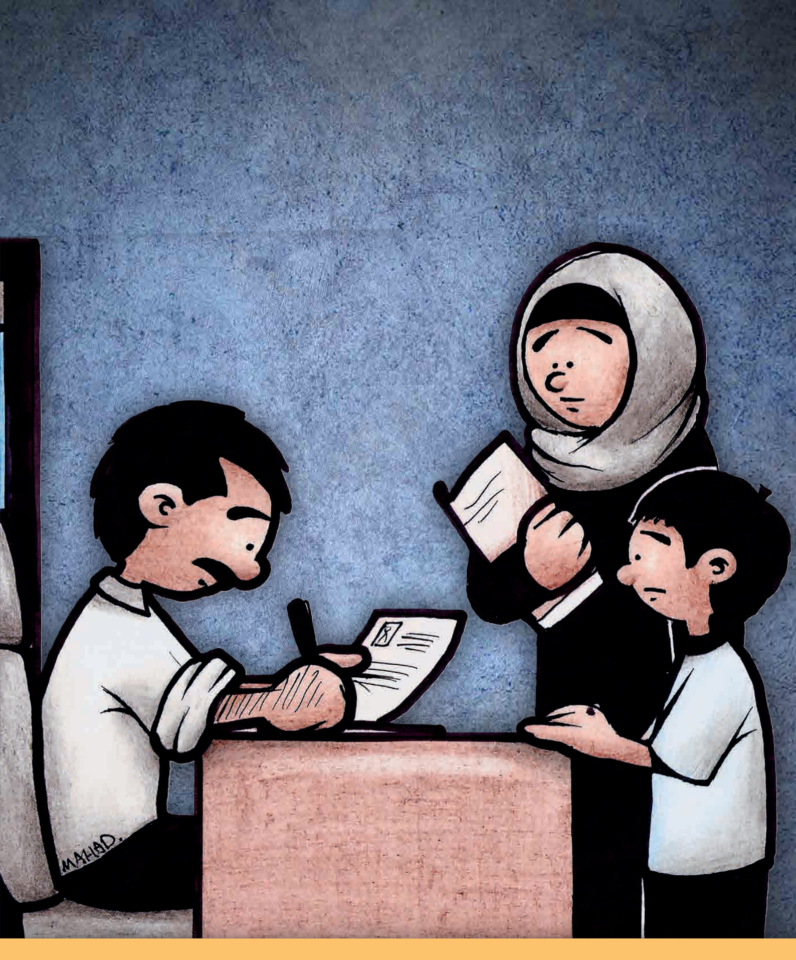
and then, simply, we will get free and good education