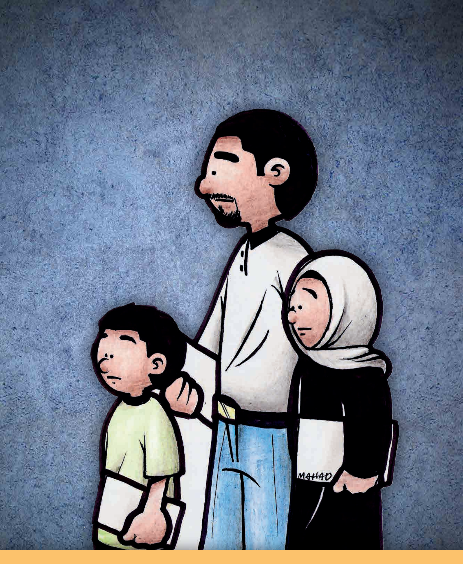
When I go with my father to enroll in school,