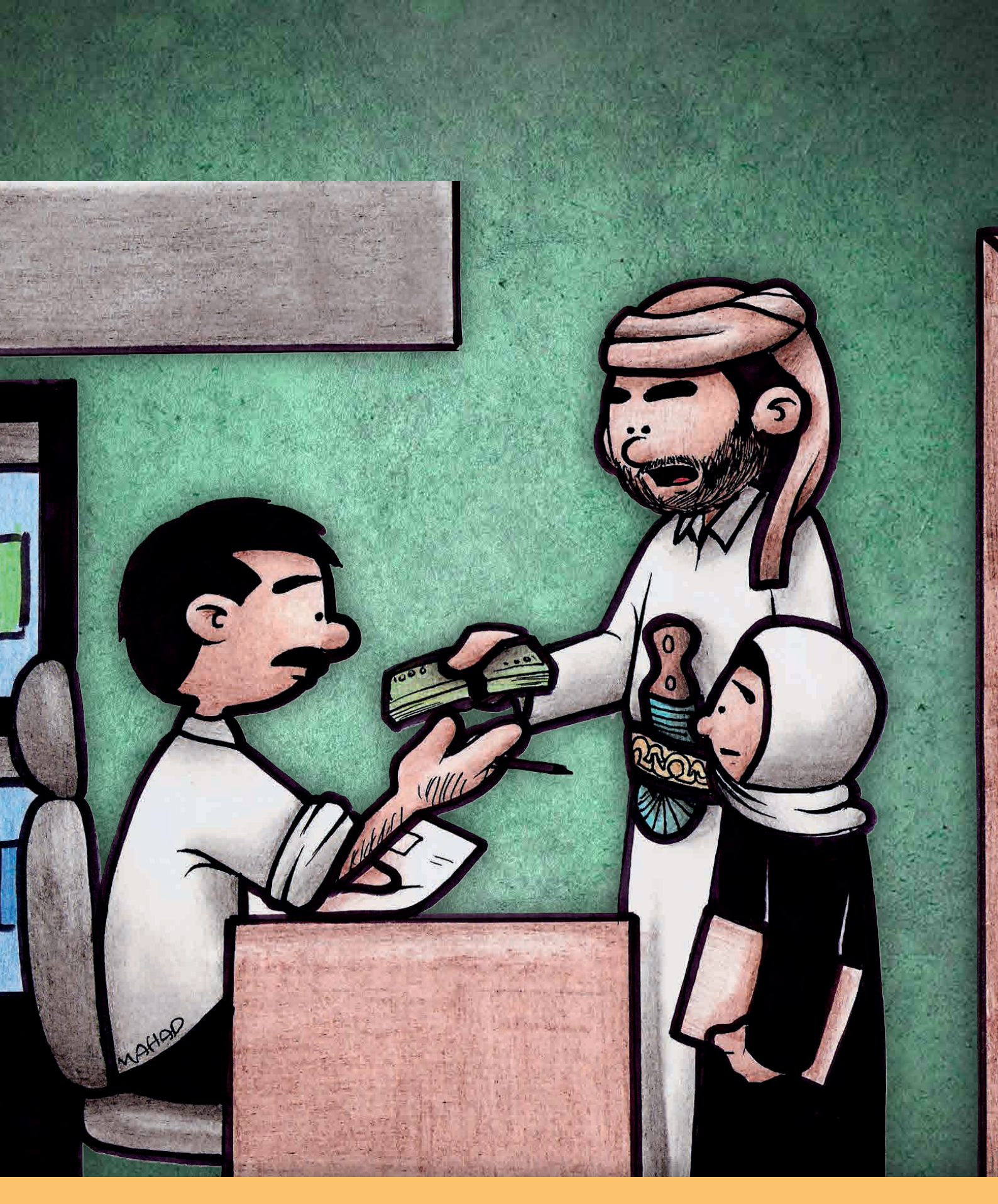
I will tell him that paying fees is not legal